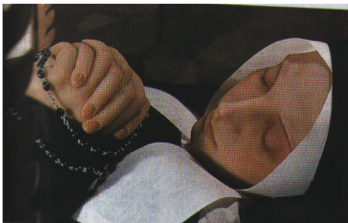
St Bernadette's incorrupt body, may be seen in Nevers, France

incorrupt body (at the age of 169) can be seen in her convent in Nevers, France with a new rosary on her hand.